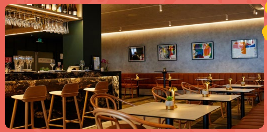
'The Lounge' evening dining area.

UNSW Sydney has generously provided the venue for the 2024 Luminesce Alliance Conference. UNSW is a powerhouse of cutting-edge research, teaching, and innovation and is one of the top 100 universities in the world, with more than 59,000 students and a 7,000-strong research community.