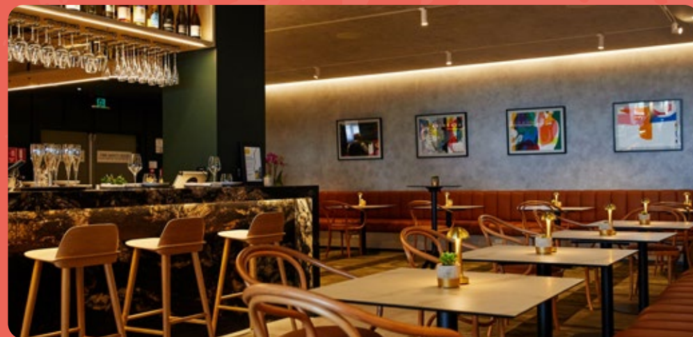
'The Lounge' evening dining area.

UNSW Sydney has generously provided the venue for the 2024 Luminesce Alliance Conference. UNSW is a powerhouse of cutting-edge research, teaching, and innovation and is one of the top 100 universities in the world, with more than 59,000 students and a 7,000-strong research community.